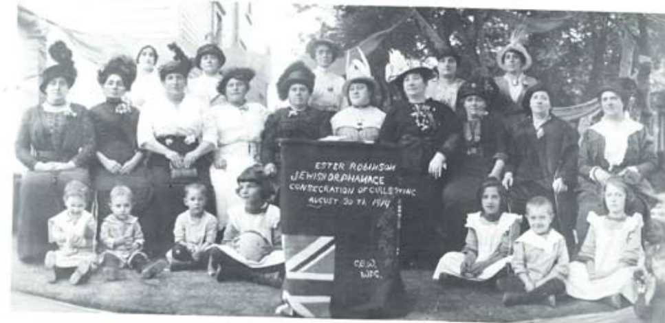
Esther Robinson Jewish Orphanage 1914